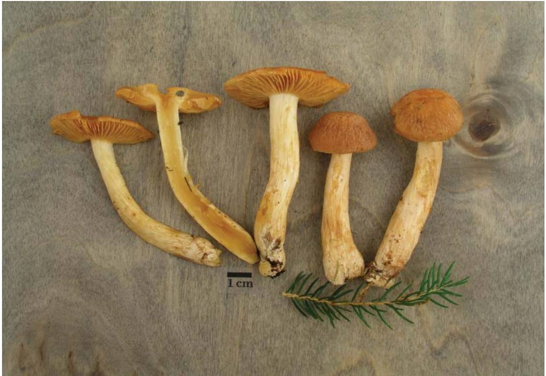
Fig. 1. Cortinarius lustrabilis , Norway, Hordaland, Ulvik commune, Stokkavattnet, by the Espelandselv, 2005 Niskanen 05-218 (H).

Spores: (8.3)8.5–9.5(10.1) × 5.1–5.9(6.4) μm, Q=(1.49)1.54–1.72(1.79) (80 spores, 4 collections, Fig. 2), \bar{X} =8.8–9.3 × 5.4–5.7 μm, \bar{X}Q =1.62–1.66, ovoid to amygdaliform, rather thin-walled, faintly dextrinoid, finely to moderately and separately verrucose, more strongly at the apex. Hyphae of the gill trama: in the overall view yellowish, finely to more strongly zebra-striped incrustated, with small, colourless crystals, in the holotype the crystals appear in tree-like structures in other specimens they are solitary. Basidia: 4-spored, 25–35 × 7–10 μm, some with golden-yellow contents. Pileipellis: with a rather thick, gelatinized epicutis, uppermost narrow (2–5 μm) finely incrustated hyphae, some with golden-yellow contents, lower broader hyphae