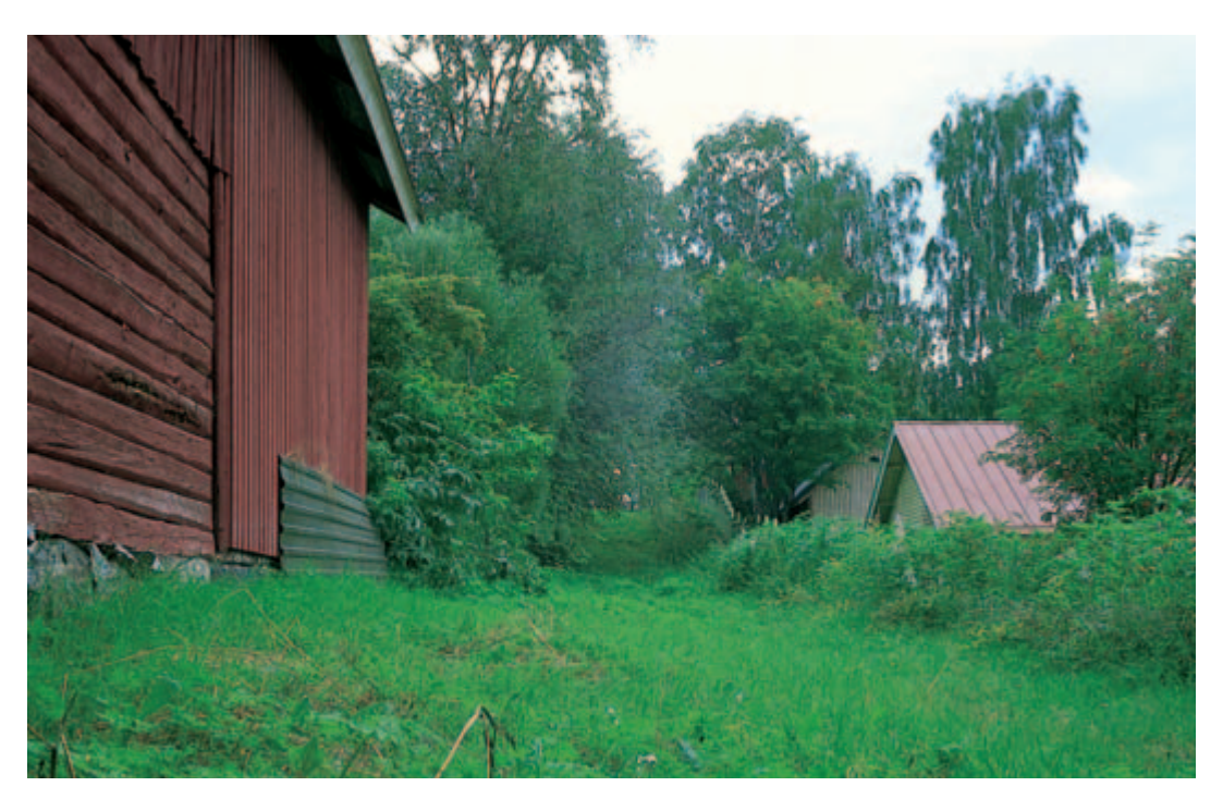
Fig. 2. The mostly open fire alley C on the northeast side of the esker. August 2003, photo: Katri Kokkonen.