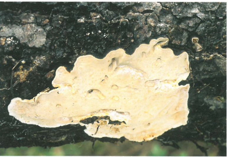
Fig. 10. Fruit body of Piloporia sajanensis . North Karelian Biosphere Reserve, Tapionaho, 2002, Niemelä 7496.