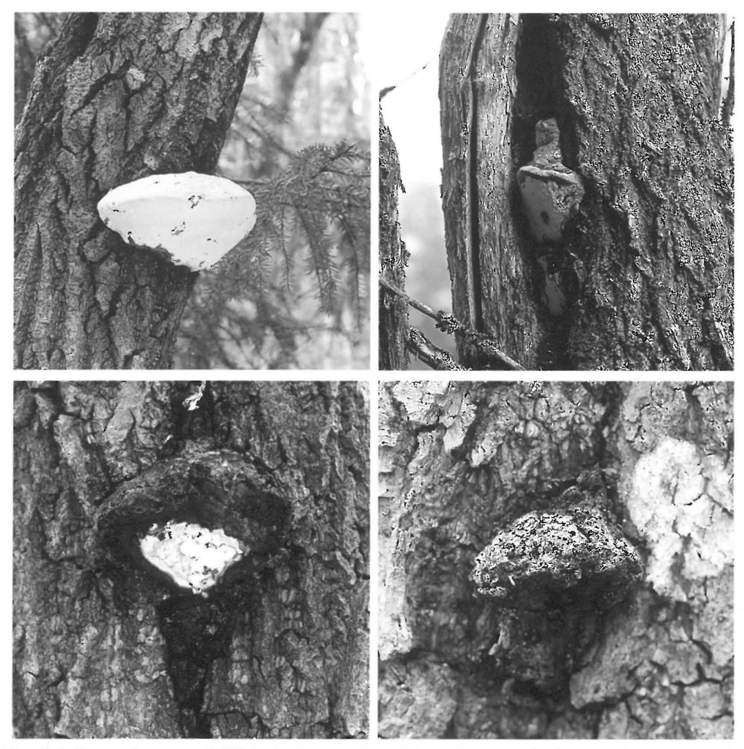
Figs. 5–8. Consecutive stages (I–IV) in the decomposition of the fruit body of Haploporus odorus . Pisavaara Strict Nature Reserve, northern Finland, 2003.

Table 1. Decomposition stages of polypore basidiocarps, according to Thunes (1994), modified. Subdivision D (dry) and W (wet) can be used for classes II–IV, if relevant.