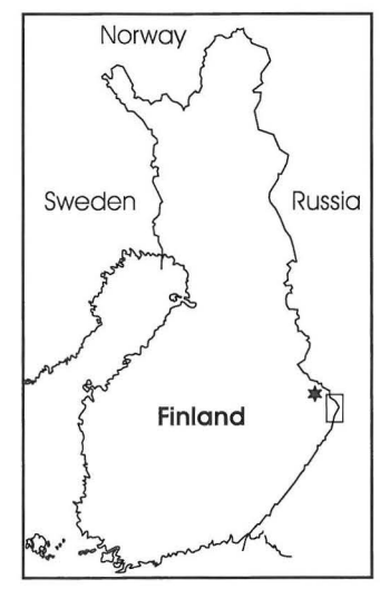
Fig. 1. The research area in easternmost Finland, North Karelian Biosphere Reserve. The Jäkäläkangas Natura 2000 site is marked with an asterisk, rectangular box marks the Koitajoki Natura 2000 site, enlarged on Fig. 2.

The Koitajoki Natura 2000 site is an important wilderness area in eastern Finland (Figs. 1, 2). It is situated in the transition zone of northern mires (pohioiset aapasuot) and southern raised bogs (eteläiset keidassuot). In the area there are relatively large and natural mires and bogs with mosaic-like forests on mineral soil. Most of the forests are seminatural and old, with plenty of dead wood but with some old signs of previous selective cuttings. An important element of this Natura 2000 site is the Koitajoki, a shallow and meandering river with sandy banks (Figs. 3, 4). The Koitajoki Natura 2000 site maintains important rare and threatened species of polypores (Bondarceva et al. 1995; Bondartseva et al. 1998, 1999, 2001, Niemelä et al. 2002), beetles (Yakovlev et al. 2001) and other organisms.