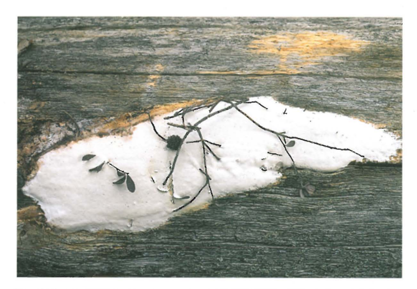
Fig. 9. Fruit body of Antro dia crassa . Posio, Korouoma Nature Reserve, 2001, Niemelä 7085 .

Hyphodontia latitans was reported from the same area already by Bondartseva et al. (1998). We recollected the species in another site of the Koitajoki Reserve, from a thin (9 cm diam.), strongly decayed fragment of spruce trunk. These are